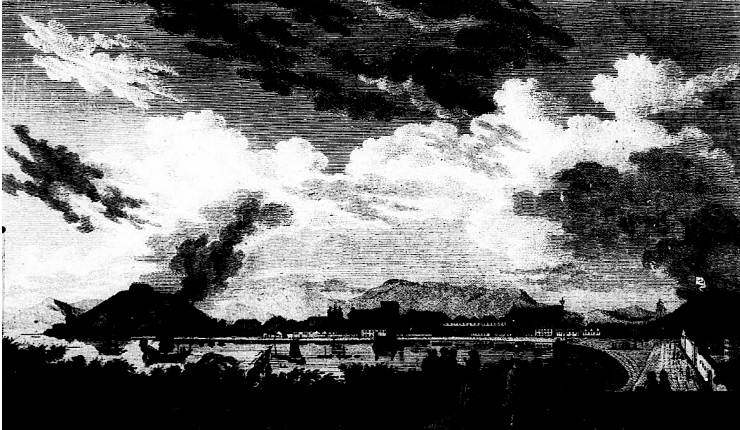
[View of Macao]