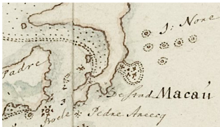
[Detail: "De stad Macau"]