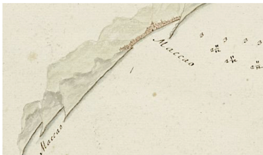
[Detail: "Macao" (City and bay)]