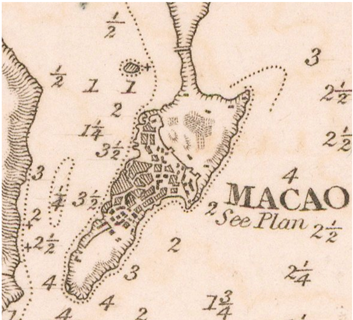
[Detail: Macau (Macao)]