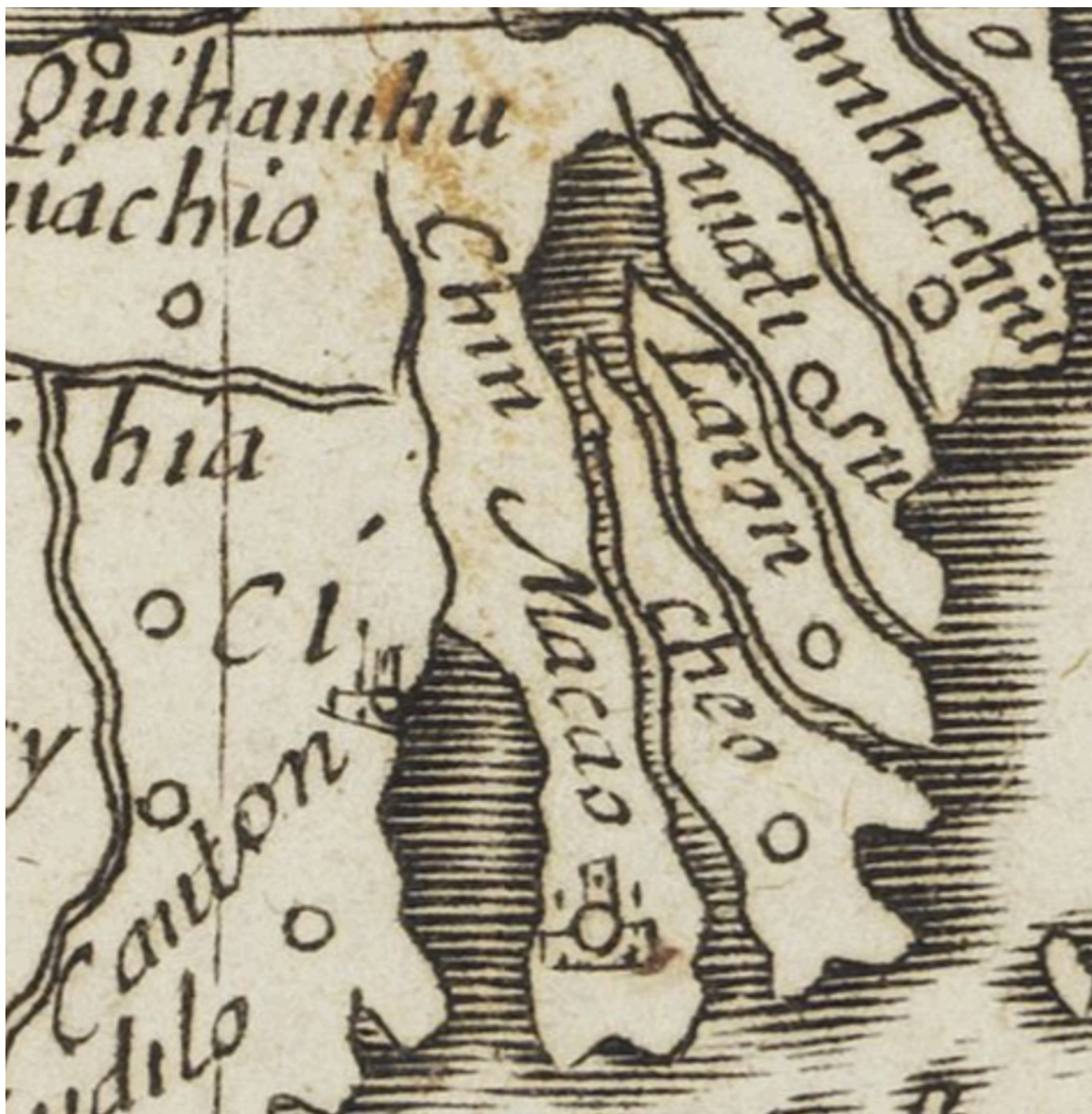
[Detail: Macau (Macao)]