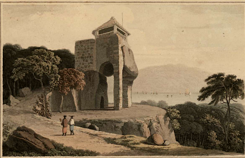
CAMOENS CAVE, MACAO.