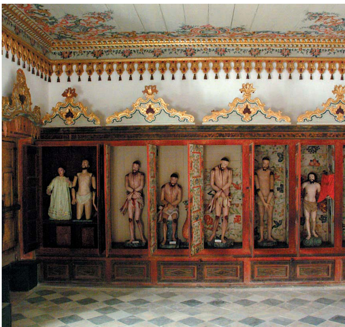
[General panorama in the Order do Carmo museum, Cachoeira (Minas Gerais)]

[Cristos Chineses da igreja da Ordem Terceira do Carmo de Cachoeira (Minas Gerais.)]