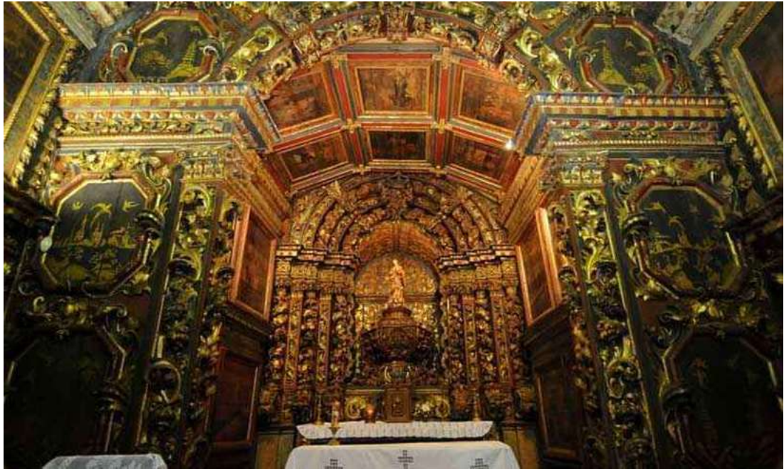
[Detail with Chinese motifs in the arch lateral columns]