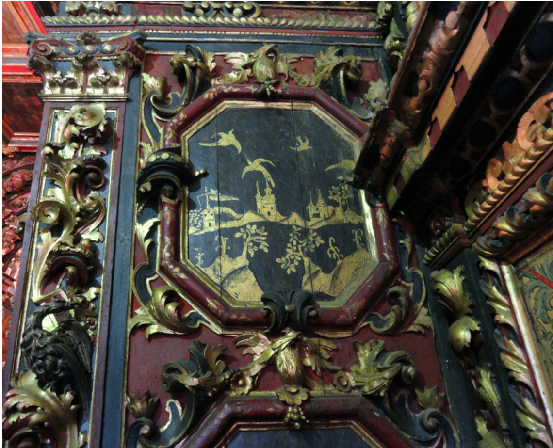
[Detail with Chinese motifs in the arch-right lateral column]