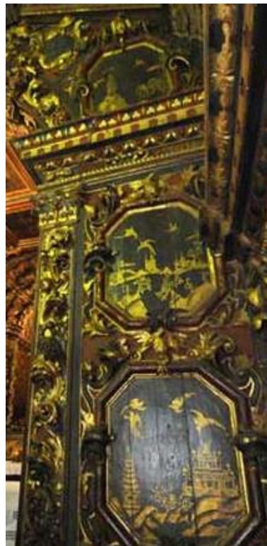
[Detail with Chinese motifs in the arch-right lateral column]