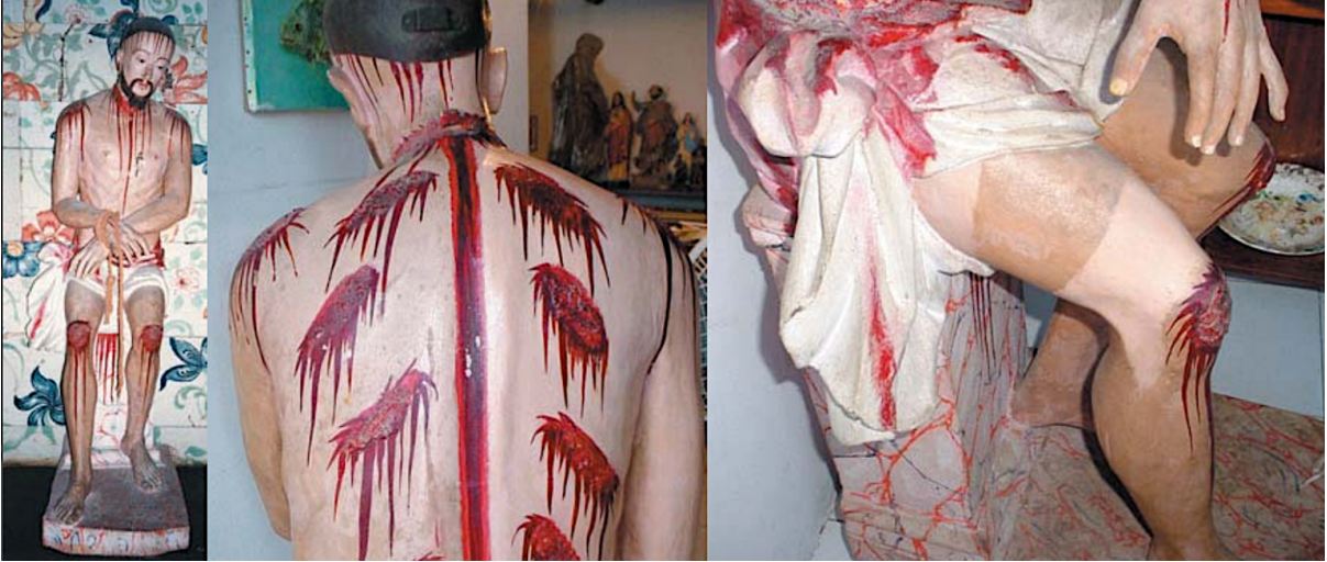
[Details of a figure of Christ]