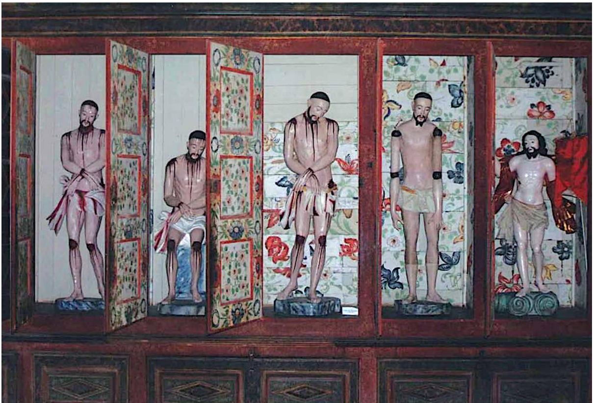
[Detail: the “Chinese Christs”]