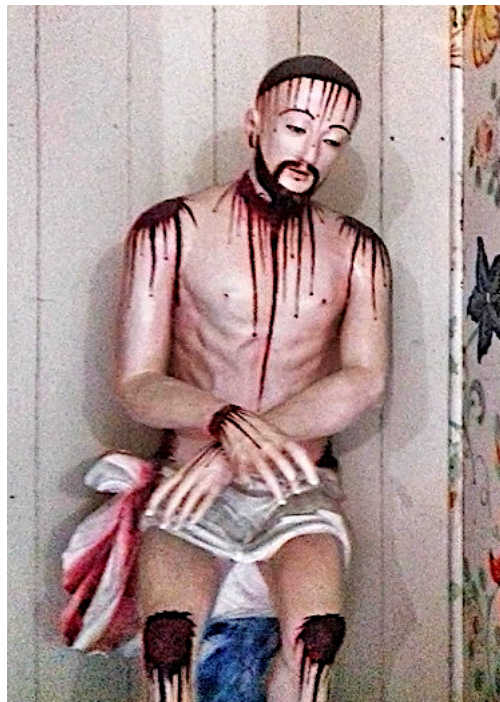
[Detail of a figure of Christ]