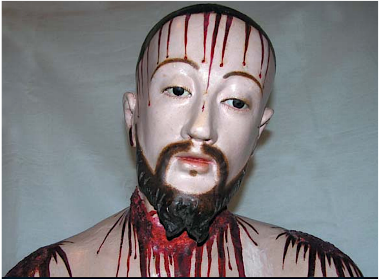
[Detail of a figure of Christ]