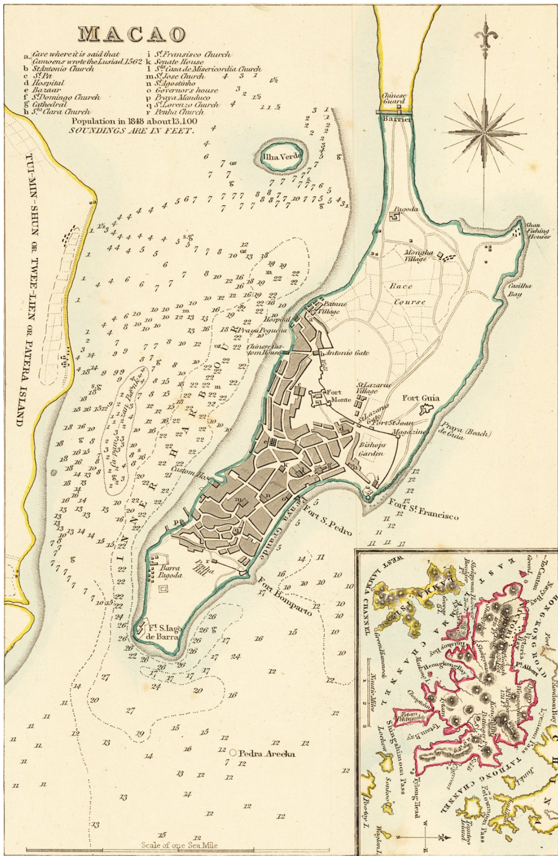
[Detail: Macau (Macao) and Hong Kong]